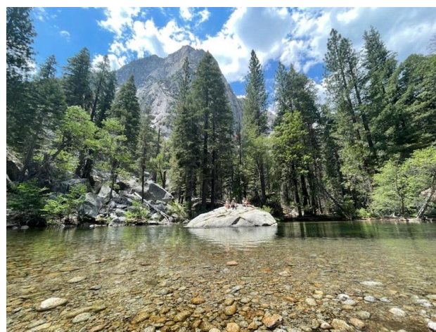
A view of the Kings River from a camping trip to Kings Canyon National Park. (Sara Volle)